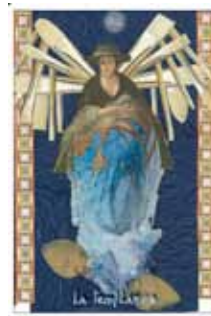
Temperance #14 Healing. Guardian Angel. Moderation and balance. Reciprocity. Internal circulation. Purification of the Soul. Divine Messenger. Elixir. Divine help. Double flow of vital forces. Medicine. Emotions and soul in balance. Gifts and Receptivity.