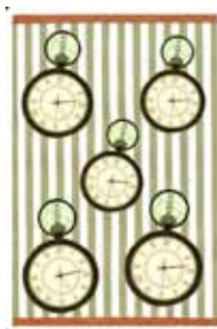
5. Possibility of enrichment.