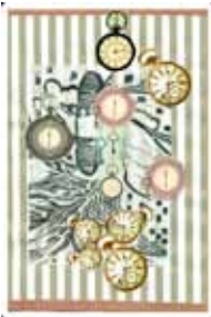
10. Realization of the spiritual through the material.