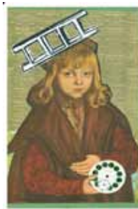
11. Prudence and perseverance. Lies.