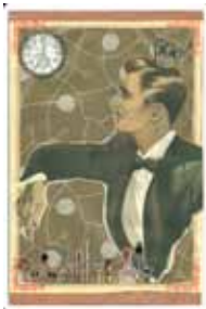
13. A man who lives comfortably in prosperity.