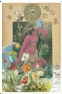
The Star #17

Rupture of structures. That which was invisible comes to the surface. Explosion. Instant inspiration. Illumination.