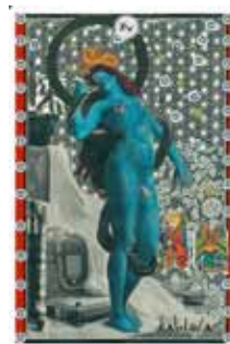
Diablo/Diablo Devil #15 (See explanation above)