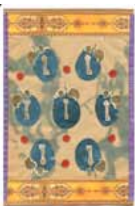
7. Free and fluid creativity and sexuality.