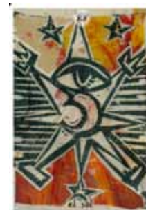
The Sun #19

Maternal archetype. Cosmic mother. Femininity. Deep intuition. Unconscious dream. Illusions. Secrets. Madness and superstition.