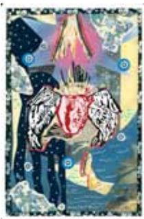
Ace of Flying Hearts Potential love.