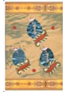
3. First experiences of carnal pleasure.