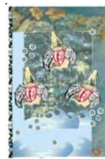
3. First emotional experiences.