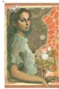
12. A woman who cares about her money and who knows how to take care of it. She can be greedy.