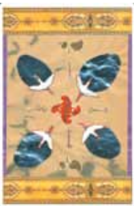
4. Creative security. Risk of getting stuck or reaching a stumblin' block.