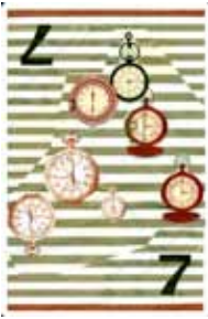
7. Gestation of the spirit.