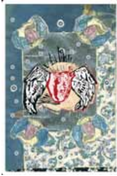
5. Fanatical love. Faith.