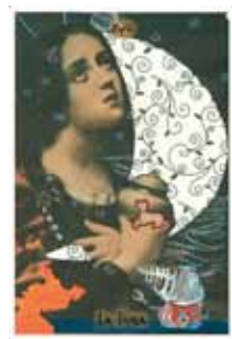
The Moon #18

Giving oneself to the world. Gift. Mediumic reception. Universal love. Providential help. Grace. Muse. The lover. Sanctify the place. Peace. Music. Perfume. Paradise.