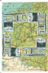
4. Practicality. Science.