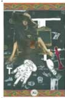
(Unnamed) #13 Change. Deep transformation. Revolution. Elimination of obstacles that prevent us from moving on.