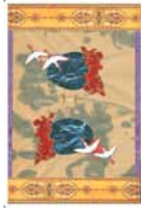
2. Accumulation of energy.