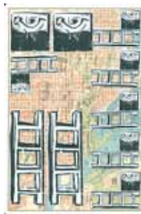
8. Abstraction and emptiness. Spiritual reception on the intellectual level.