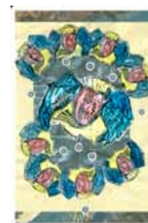
9. Universal love.