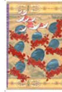
8. Sexual energy sublimated in the spiritual plane.