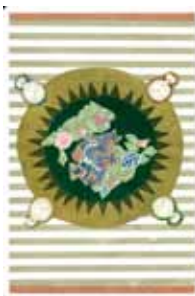
4. Material stability; when not put into action it stagnates.