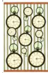
9. Childbirth and creation. New work.