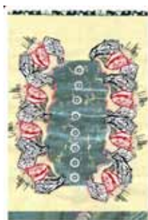
8. Charity and love.