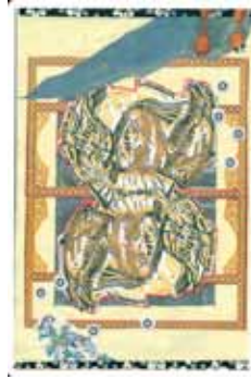
2. Accumulation of feelings.