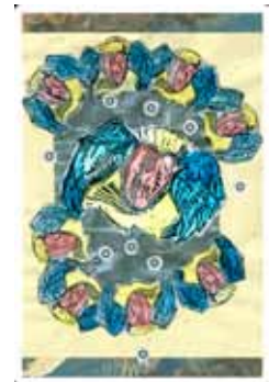
9. Universal love.