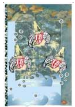
3. First emotional experiences.