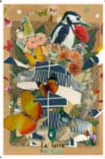
The Tower #16

Rupture of structures. That which was invisible comes to the surface. Explosion. Instant inspiration. Illumination.