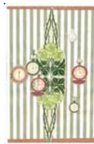
6. Inner talent which one needs to be discovered.