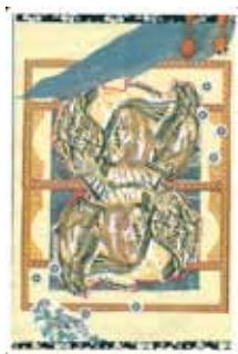
2. Accumulation of feelings.