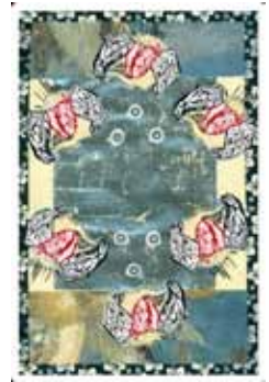
6. Finding a soulmate.