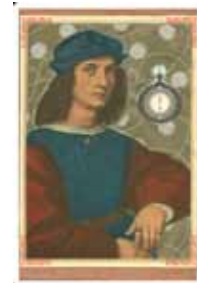
14. Enlightened one who has evolved from the material to the spiritual.