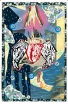
Ace of Flying Hearts Potential love.