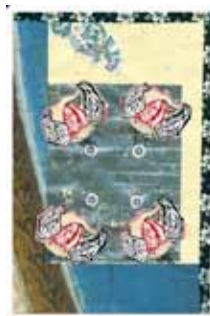
4. Foundations. Acceptance of the partner. Path to real love.