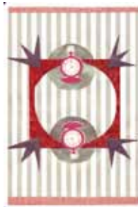
2. Material accumulation.