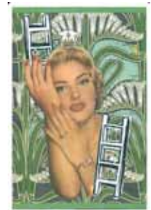
12. Powerful intellect.