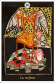
The Wait #12 (See explanation above)