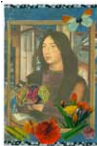
15. Life at the service of the World.