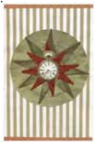
Ace of Clocks Treasure