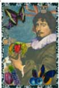
14. Vast emotional experience.

13. This card is the unconscious manifestation of the Queen of Flying Hearts (above).