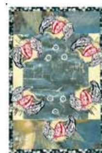
6. Finding a soulmate.