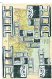
10. Unification on the mental level.