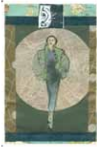
14. Intellectual going out into the world. Receptivity.