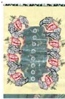
8. Charity and love.