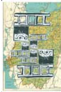
5. Intellectual life. Appearance of an ideal.