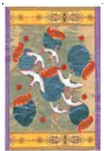
6. Sexual encounter.