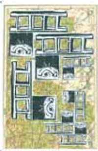
7. Learn to receive. Objective knowledge.