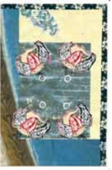
4. Foundations. Acceptance of the partner. Path to real love.