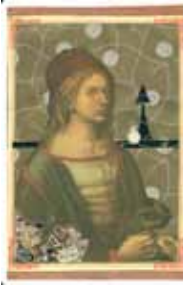
11. Joviality. Brilliant student.