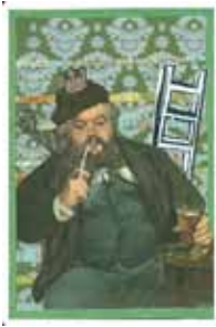
13. Control of thought leading to action.