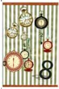
8. Health. Harmonious realization. True wealth.