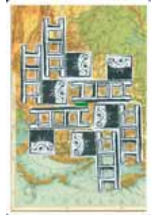
6. Assume individuality.