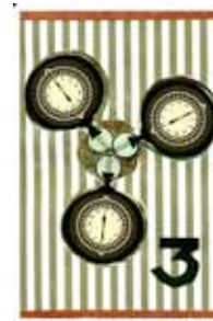
3. Treasure that needs to be appropriated. Enthusiastic beginning.