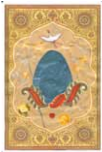
Ace of Eggs, Perfect World. New beginning. Creative Act.