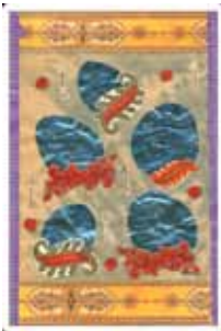
5. Transition to a new creative dimension.