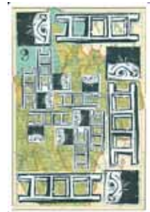
9. To learn to listen to others.